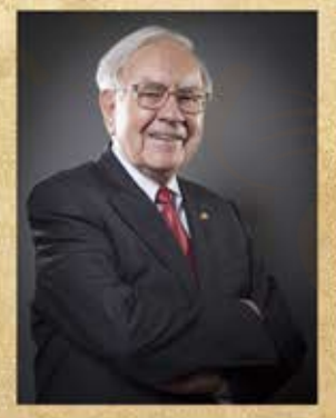
Warren Buffett - Entrepreneur (August 30, 1930)

French Emperor from 1804 to 1814 and briefly in 1815, a military leader and statesman who laid the foundations of the modern French state. He is regarded as one of the most influential figures in Western history. Napoleon suffered a significant defeat in the War of 1812 against the Russian Empire.